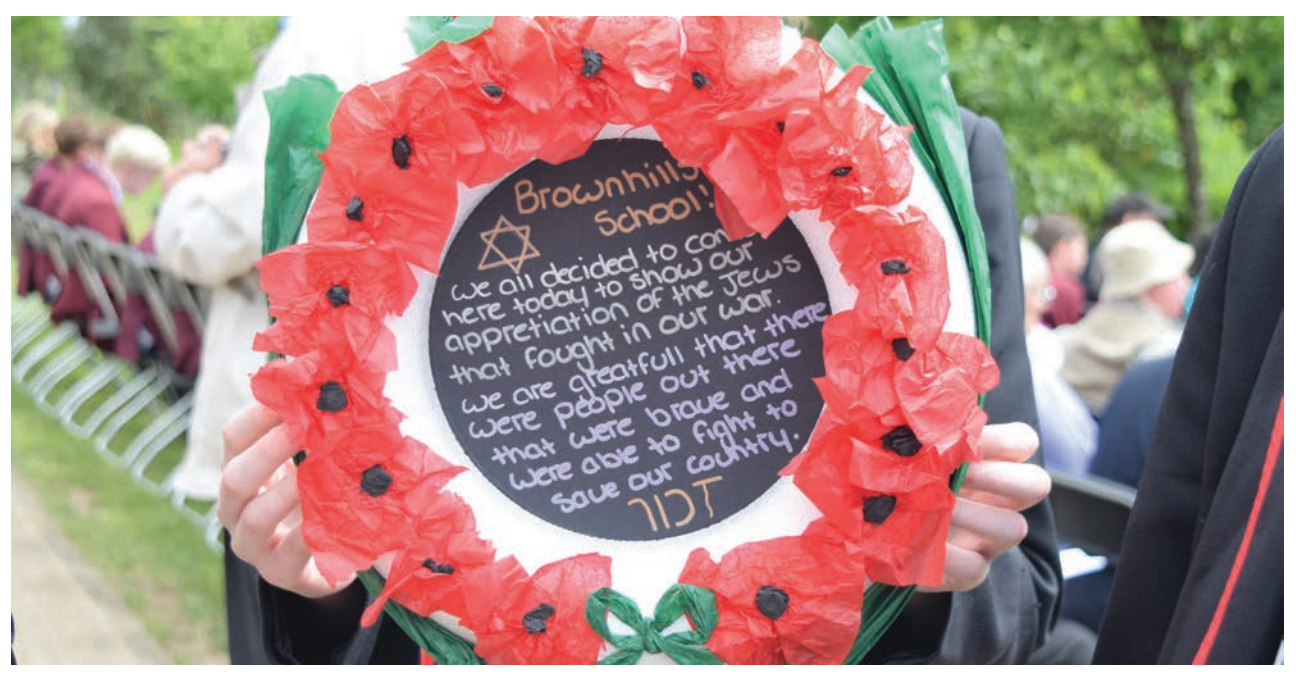
Poppy wreath created by school students for the Annual Remembrance Ceremony at the National War Memorial Arboretum

Following the move of the Jewish Military Museum to the Jewish Museum London at the start of 2015, we have continued to integrate the collection into our work.