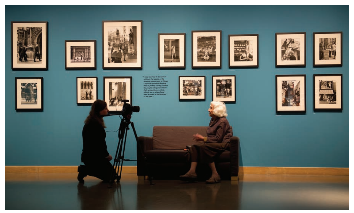
Photographer Dorothy Bohm being interviewed at the opening of Dorothy Bohm: Sixties London