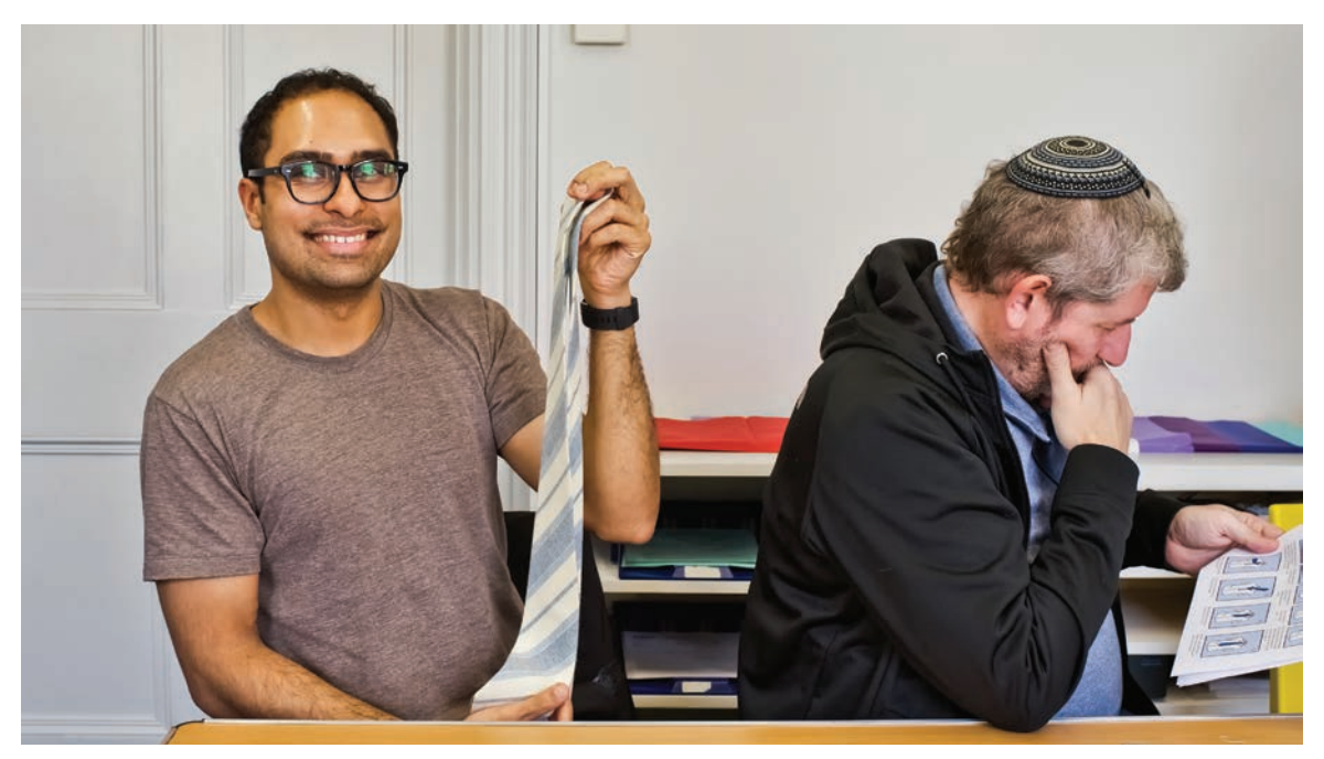
'In the Loop' tie-making workshop

Our public programme offers a range of creative ways for visitors to engage with the museum; whether it's listening to live music, relaxing at one one of our late openings or watching a Ceramicistin-Residence working at a potter's wheel.