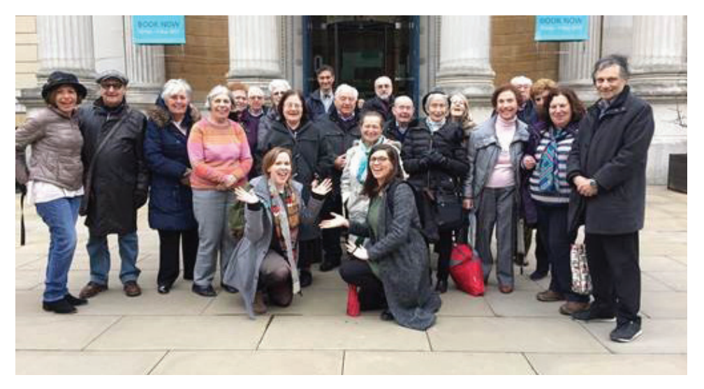
Our volunteers on the 2017 trip to museums in Oxford