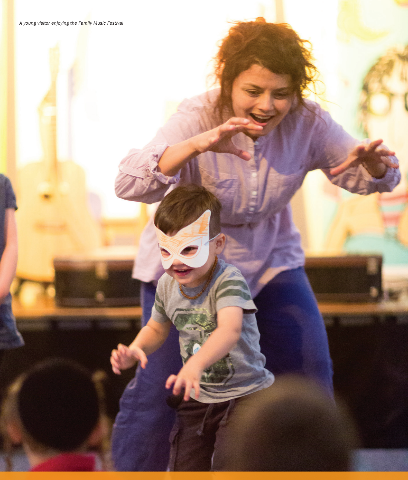
"We had a wonderful visit to the museum for the Family Day. The museum has such a lovely ambience and I look forward to many happy times there in future."