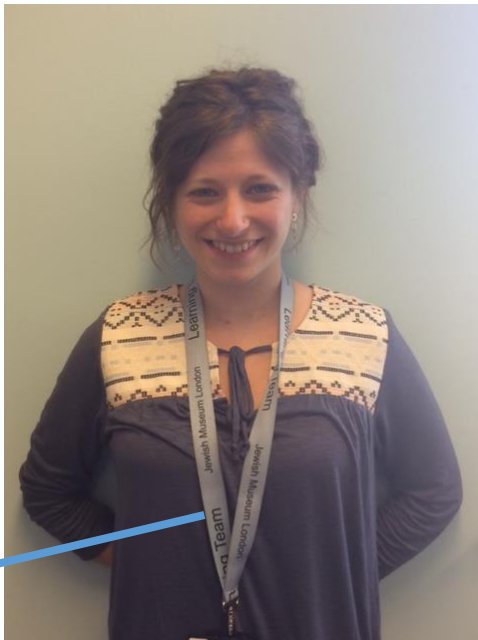
Learning Team Member